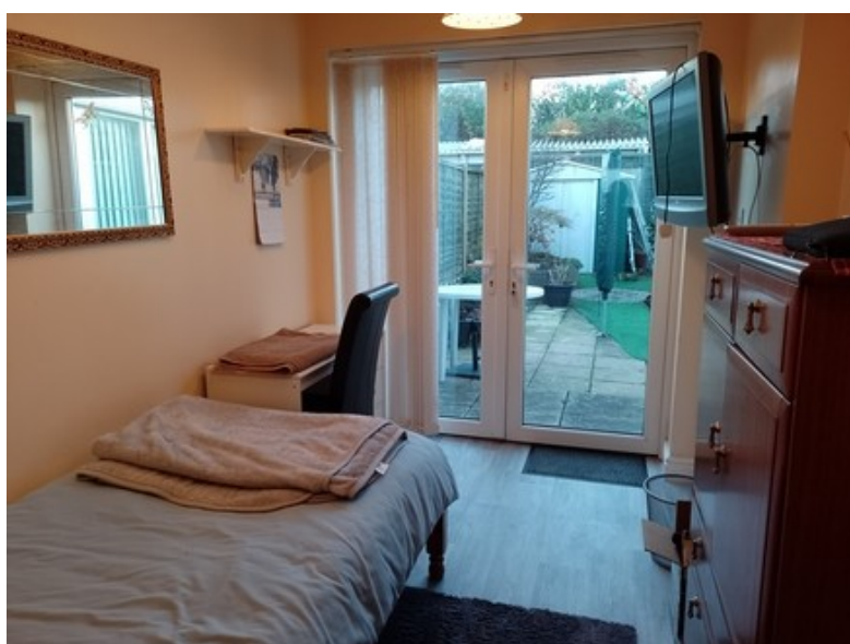
Photo right and below are the downstairs extension.

Visit Dorset | Holidays in Dorset | Official Destination Website